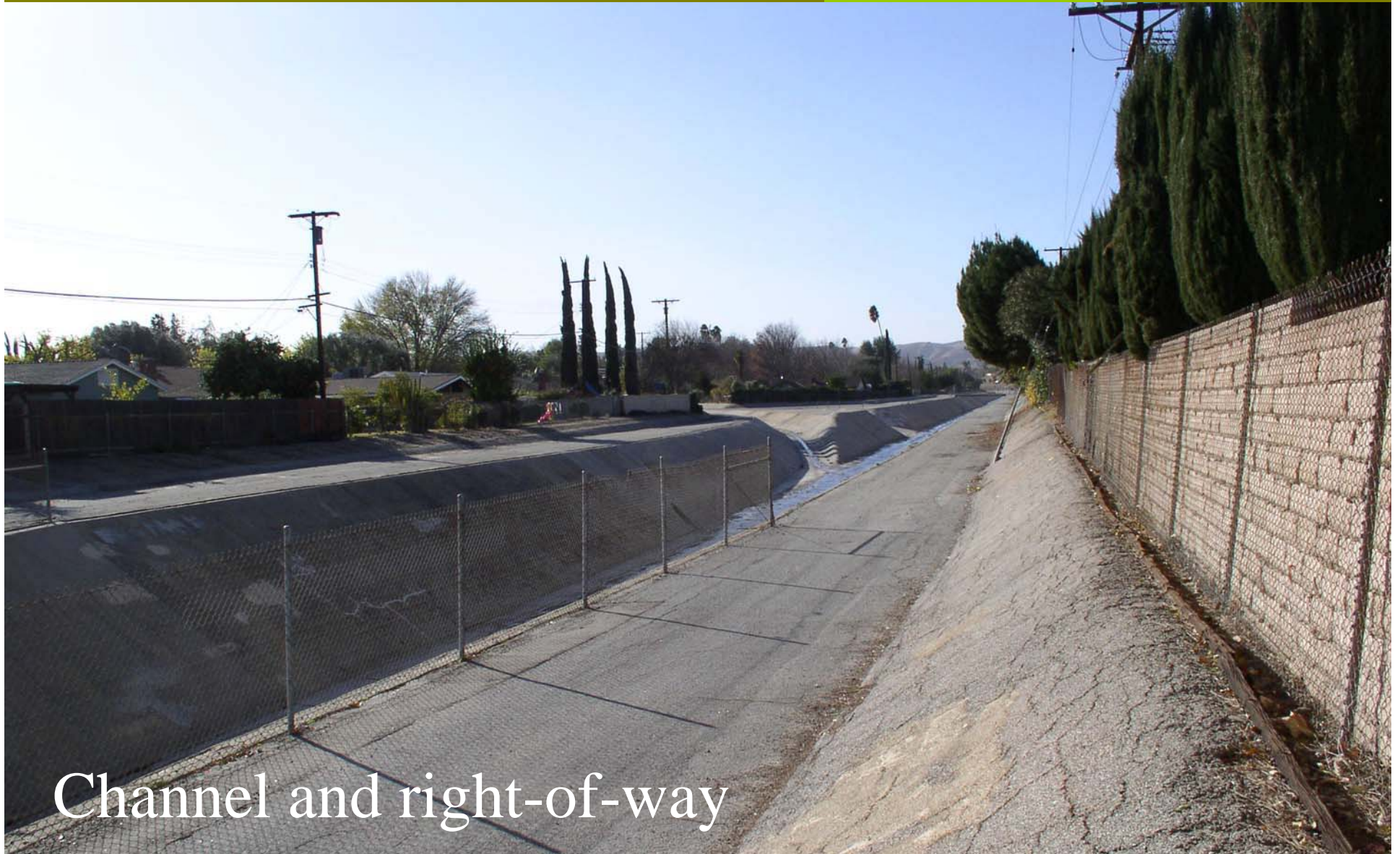
Channel and right-of-way