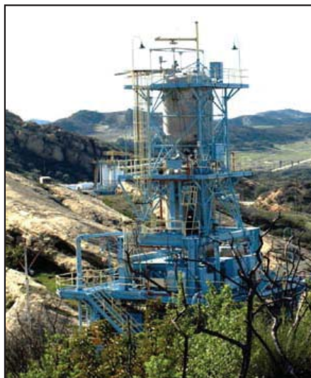
EXHIBIT 2: One of the test stands at the Alfa Test Stand complex

The SSFL site, 2,850 acres in Ventura County, California, is approximately 7 miles northwest of Canoga Park and 30 miles northwest of downtown Los Angeles. SSFL is, for reference purposes, composed of four areas known as Areas I, II, III, and