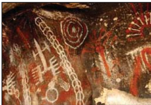
EXHIBIT 3: Burro Flats Painted Cave

historical importance of the engine testing and the engineering and design of the structures.