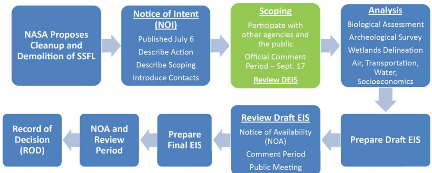
EXHIBIT 4: EIS Process

In both the NASA EIS and the DTSC EIR, the potential impacts from the federal (NASA) actions for cleanup and demolition at the site will be examined. The NASA EIS is expected to be completed before DTSC's EIR and will be a source of information for the EIR. Exhibit 4 shows a flow chart describing the EIS process.