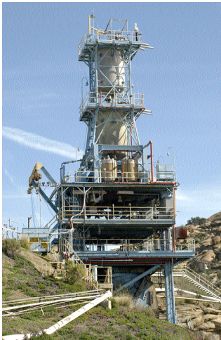
Engine testing occurred at these metal and concrete test stands.

Each contained multiple test stands: open-framed, metal structures with concrete foundations (as well as related buildings), where the engines were tested. Our extensive research indicates that, as a result of rocket testing and cleaning activities throughout the SSFL, a number of chemicals made their way into several “media” (soil, surface water and groundwater). In NASA’s areas, some of these included solvents, petroleum products (PAHs and PCBs) and dioxins, as well as some metals. NASA has worked cooperatively with Boeing (which is serving as the cleanup contractor) and the U.S. Department of Energy (DOE) on all environmental issues. While in the past Boeing has taken the lead on communicating the results of environmental activities, we believe it is important to let you know what progress has taken place and what remediation efforts are planned for the SSFL acres that NASA administers. NASA takes full responsibility for administering the cleanup of these areas, including sites that were under other ownership before we acquired them.